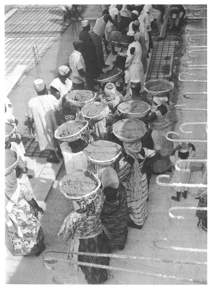
FIG. 3. Men and women from Kumasi Zongo working as volunteers to repair the Central Mosque. The work is done on Sundays, to the accompaniment of drumming.

back in the history of Asante; it goes back to the pre-colonial period, when Kumasi asserted control over the northwest, which continued right through to the post-independence period (see discussion in Austin, 1964, p. 293f; Tordoff, 1965; and Busia, 1951). Although it is difficult to claim that the Brong/Kumasi split among the