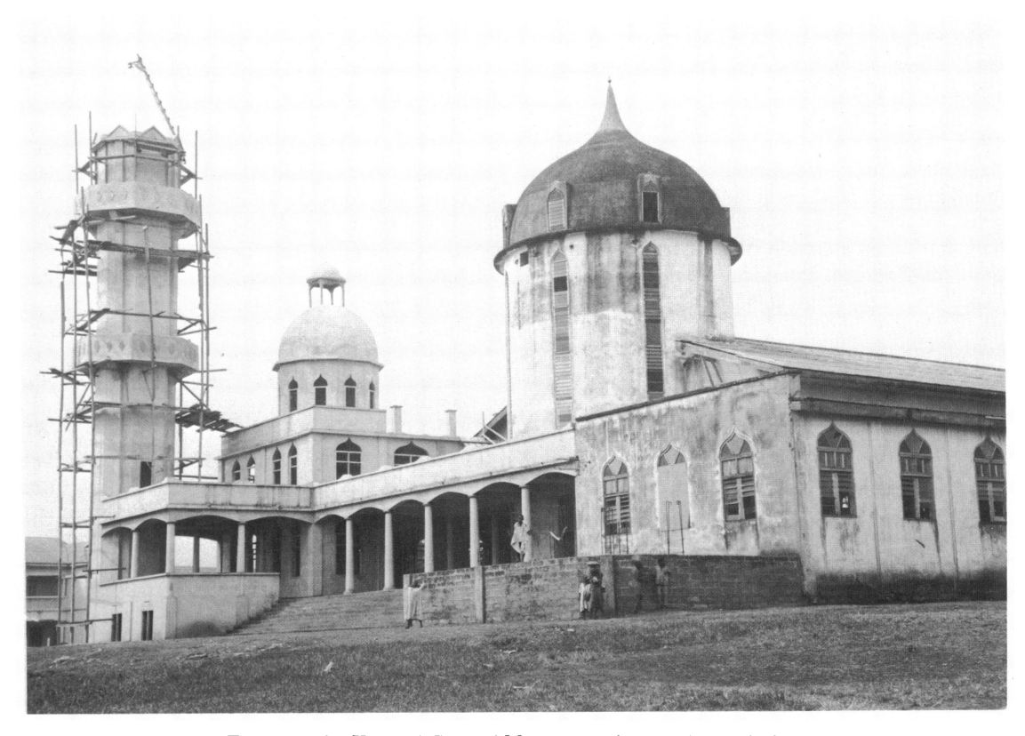
FIG. 2. The Kumasi Central Mosque under repair in 1968.

rate roles, that of Friday Imam and that of Hausa Imam, just as the political head of the Hausa community is known both as Hausa headman and as Sarkin Zongo. Even after the office of Sarkin Zongo was officially abolished the Hausa headman continued to play certain ritual roles that expressed his position as a leader of the entire Zongo. On the main Muslim festival days he leads a procession of Muslims, including the other headmen, to greet the Asantehene and the representatives of the national administration. He acts as an intermediary between the national government and the other headmen, and is often asked to arbitrate disputes between non-Hausa groups in the Zongo. Non-Hausa headmen are presented to him for recognition when they assume office even though he has no authority in their election. The Hausa Imam in his capacity as Imam al-Jum'a and the Hausa headman in his capacity as Sarkin Zongo are then symbolic